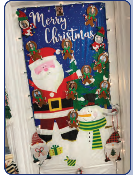
"Deck The Halls" Door Decoration - 1st Place Winner!